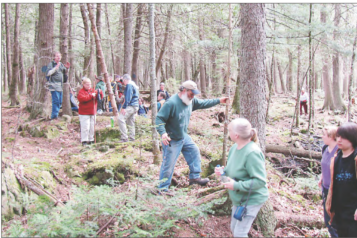
Hikers check out the old-growth forest near Wildcat Falls, north of Watersmeet, on Sunday.