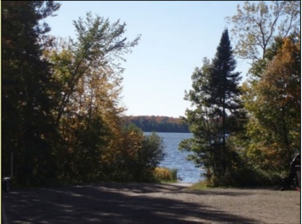
Overlooking the public boat landing on Palmer Lake, in northern Vilas County, which connects to Tenderfoot Lake via the Tenderfoot Branch of the Ontonagon River.

In 2005 a Stewardship grant through the Nature Conservancy established the 971 acre Tenderfoot Reserve protecting special old growth features and precious lake shore. Just south and east of Palmer Lake, the Northern Highland State Forest added 1130 acres in 2009 connecting the Hwy. B corridor for public access, and protecting 2 miles of the Tenderfoot Branch before it enters Palmer Lake. This project will be managed sustainably in the NHAL certification guidelines, for northern hardwoods and conifers. It contains some record size conifer trees. These two projects are a result of very different aspects of the Stewardship Fund and both are open to the public, though the Tenderfoot is accessed by water.