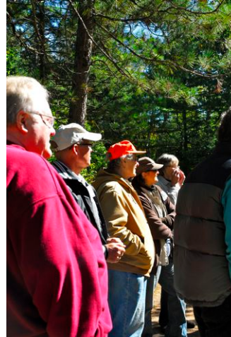
Property cut in the last 15 years.