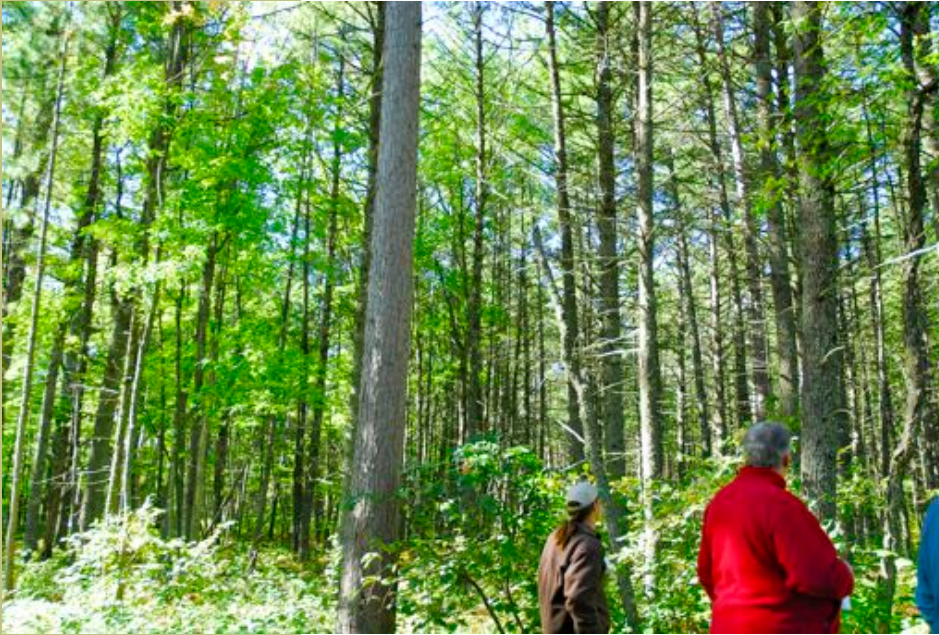
Property which has not been logged.