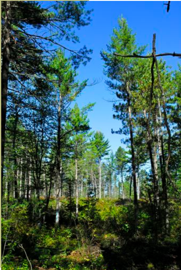
Portion of the property logged in October 2009