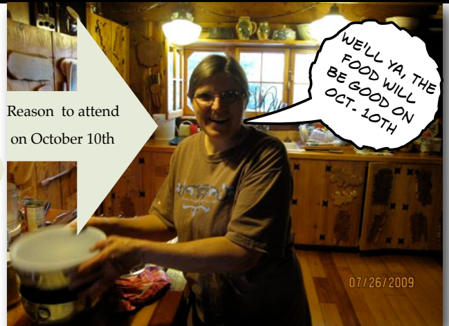
Reason to attend on October 10th