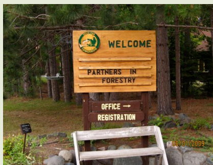
Trees for Tomorrow in Eagle River was the site of the very successful estate planning workshop.

Over seventy people demonstrated their commitment to the future of sustainable forestry by participating in the Partners in Forestry (PIF) workshop "Your Living Legacy-Estate Planning for Forest Landowners" on August 1 at Trees for Tomorrow in Eagle River. Many folks entered at registration with subtle thoughts about the future of their own woodlands. In essence, whether these lands are destined to become a family legacy, or a distant memory is indeed the