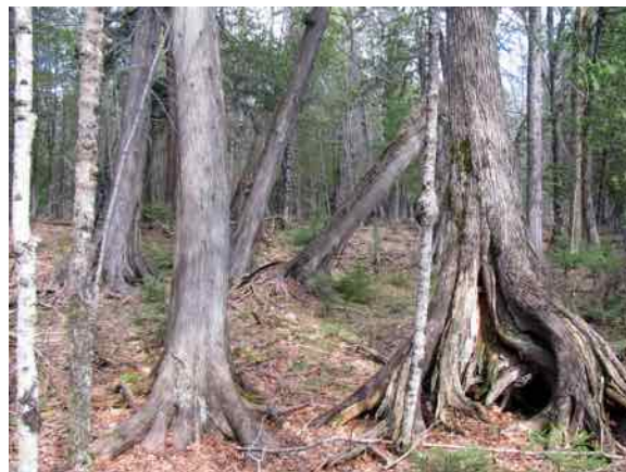
Wildcat Falls old growth

Any timber harvesting done on this parcel must be very cognizant of the features this project seeks to protect. There are significant riparian features, including ponds, flood plain wetlands feeding the creek and very coarse topography in the rock outcrops. These are all areas that are prohibitive of any harvesting practice. Any stands with safe harvesting opportunity must be in accordance with Best Management Practices and avoid any rutting or disturbance to sensitive flora.