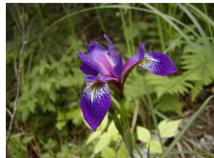
Northern Blue Flag