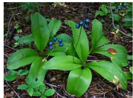
Blue Bead Lily fruit

“The Wildcat Falls property is composed of a variety of habitat types varying from upland old growth hemlock/ cedar with unusual, abundant rock outcrops and cliffs to hemlock/hardwood composed of mostly mature sugar maple, to various wetlands surrounding pristine Scott &