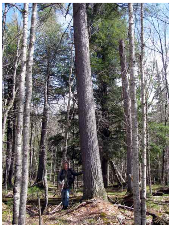
Wildcat white pine