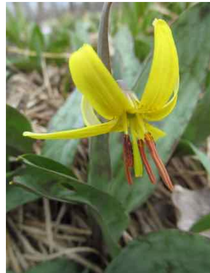
Yellow Trout Lily